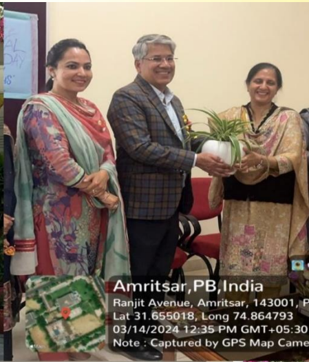
Amritsar, PB, India Ranjit Avenue, Amritsar, 143001, P Lat 31.655018, Long 74.864793 03/14/2024 12:35 PM GMT+05:30 Note : Captured by GPS Map Camera