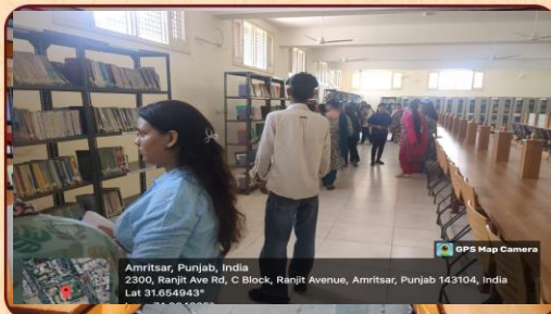
Well-equipped computerized Library with a comfortable Reading room and book-bank facility