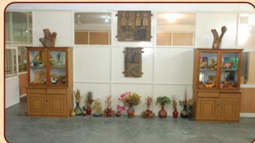
Art rich Fine-Arts Lab