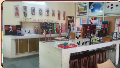
Fully- equipped modernized Science Lab