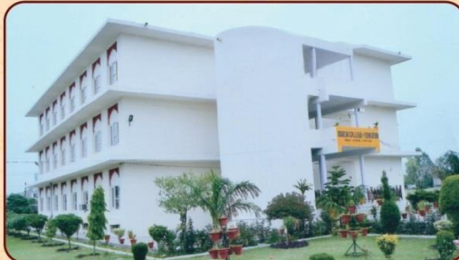
Vast campus with well maintained lawns and play grounds