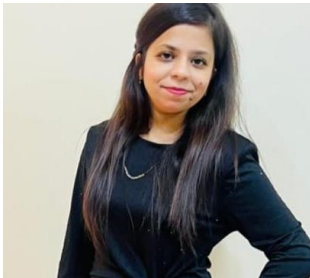
B.Ed-M.Ed (3-Year Integrated) Sem III 83.5 % B.Ed-M.Ed (3-Year Integrated) Sem IV 83.83% 2 nd Position in GNDU