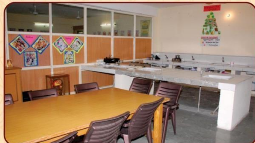
Attractive and spacious Home science Lab