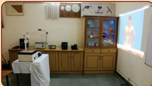
Air-conditioned Technology Lab with innovative Audio-visual aids