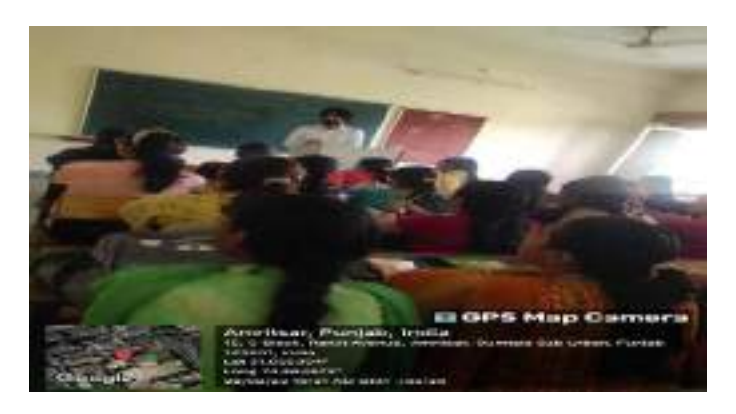
education of the children.