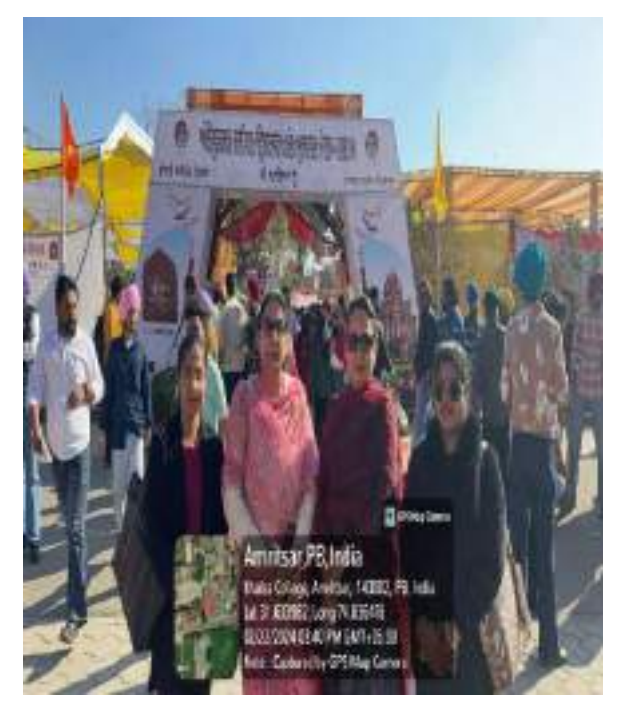
reading habits among the young generation.

A book fair at a very large level was organized from 21<sup>st</sup> -25<sup>th</sup> February, 2024 in collaboration with various sister institutes of Khalsa College Charitable Society with the objective to encourage the good readers to have access to qualitative books at one place and to develop