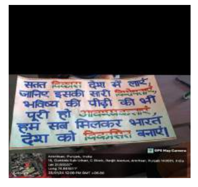
among the participants.