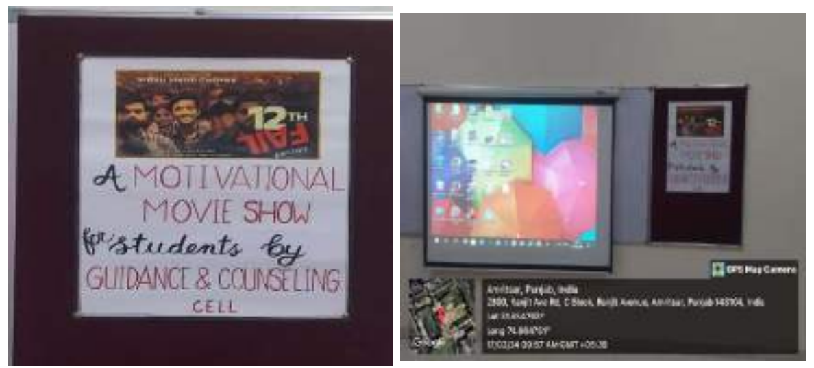
aspirations, struggle and hard work.

The Guidance and counselling cell of the college took the initiative to let the students get fruitful experience of student life. with the given objective a motivational movie "12<sup>th</sup> Fail" was shown to the students within the college premises on 17<sup>th</sup> February, 2024 which is a case study for