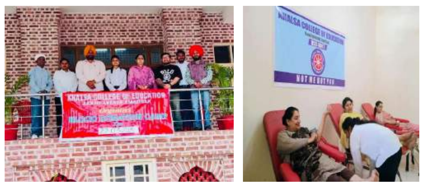
teaching staff along with the students came to donate blood.

College of Education, Ranjit Avenue, Amritsar organisedBlood Donation camp in the college premises on 22<sup>nd</sup> March, 2024 in collaboration with Parvati Devi Hospital, Amritsar. All the required arrangements of beds, sanitation etc.Were made. The team of doctors from the concerned Hospital rendered their services for the cause. All the interested Teaching and non-