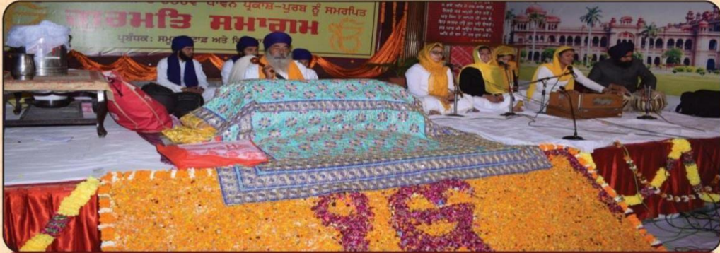
AKHAND PATH SHRI GURU GRANTH SAHIB JI

Celebrations on 550th Birth Anniversary of Shri Guru Nanak Dev Ji