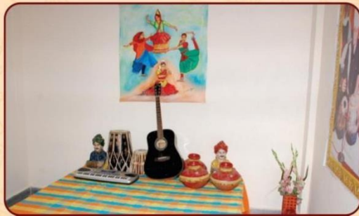
Well-equipped Music Room