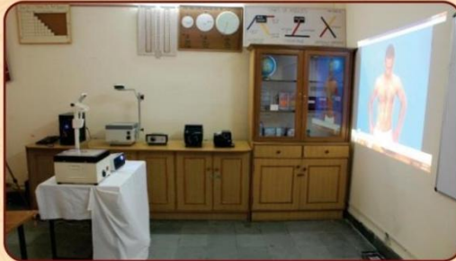
Air-conditioned Technology Lab with innovative Audio-visual aids