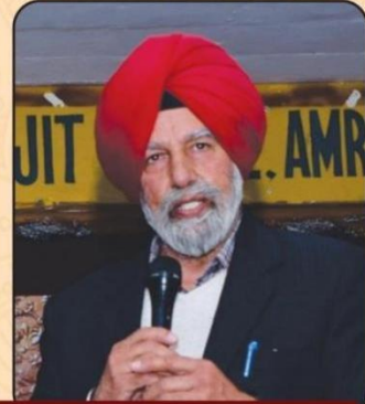
LARIVAAR LECTURES ON THE TEACHINGS OF GURU NANAK DEVJI