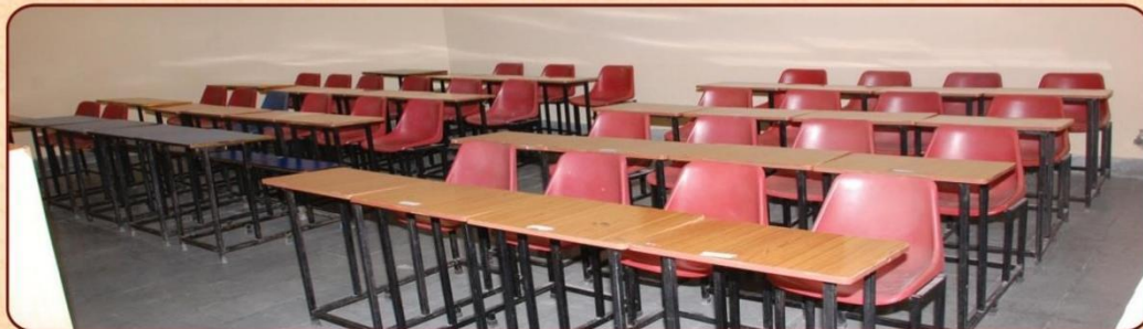
Comfortable and well furnished class rooms