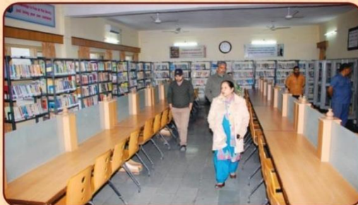
Well-equipped computerized Library with a comfortable Reading room and book-bank facility