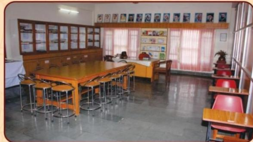
Well-equipped Psychology Lab and Guidance / Placement cell