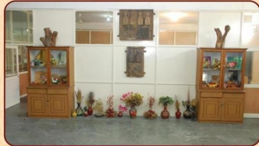
Art rich Fine-Arts Lab