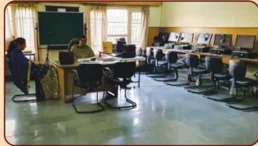
Air-conditioned computer lab/ Language lab with Wi-Fi facility