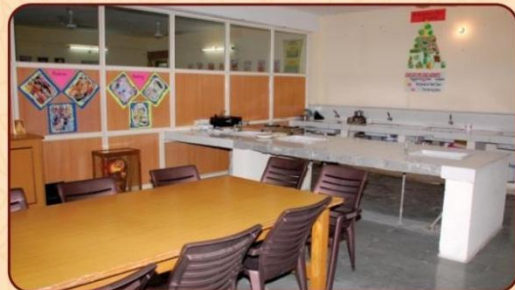
Attractive and spacious Home science Lab