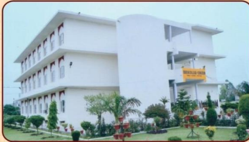
Vast campus with well maintained lawns and play grounds