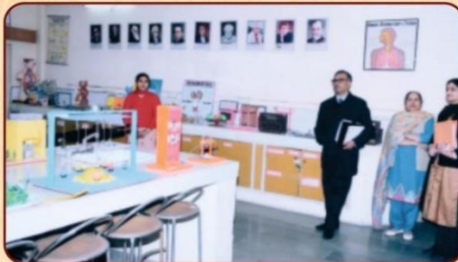
Fully- equipped modernized Science Lab