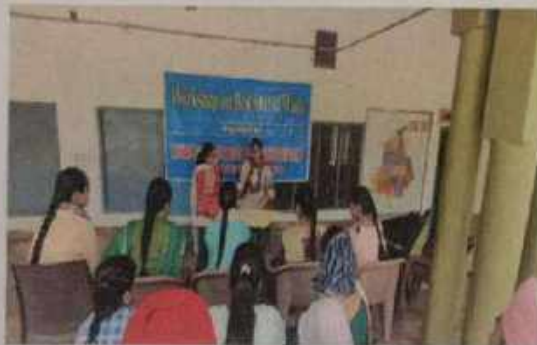
Principal Khalsa College of Education Ranjit Avenue, Amritsar