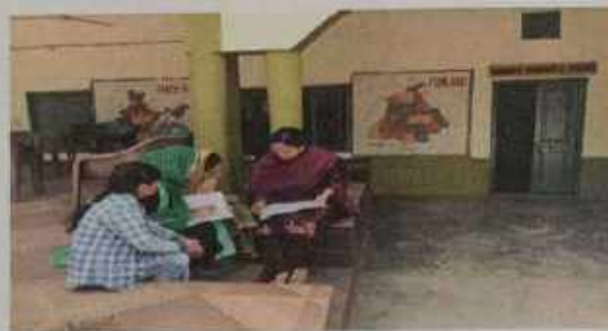
Principal Khalsa College of Education Ranjit Avenue, Amritsar