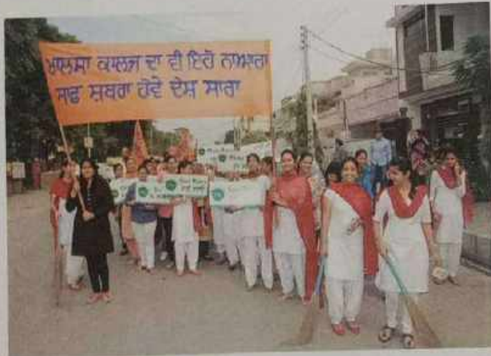
Principal Khalsa College of Education Ranjit Avenue, Amritsar

On October 25, 2019, Khalsa College of Education, Ranjit Avenue, Amritsar conducted a Swachh Bharat Campaign. 134 students participated in the event under the supervision of 5 faculty members. The main goal of the campaign was to spread awareness among localities' about the prevailing threats of unhygienic environment and ways to keep our surroundings clean. The students carried the hand drawn posters and raised slogans for the same. The students carried the Jute bags and violated the use of plastic bags for the disposal of the waste.