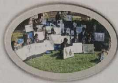
Principal Khalsa College of Education Ranjit Avenue, Amritsar

Khalsa College of Education, Ranjit Avenue, Amritsar took an initiative to celebrate World Aids Day and Human Rights day on 1/12/2016 for which an art competition was organized in different schools of the city. The competition was organized by 150 B.Ed. Students of the college in their practicing schools during internship. December 1 was chosen (World Aids Day) collectively on which the event was organized in all schools. Approximately 200 school students from 15 partner schools participated in the event. Competitions were organized on to spread awareness about these issues. The judgment was given by the art teacher of each school along with two prospective teachers. Winners were announced from each school and awards were distributed by the college students.