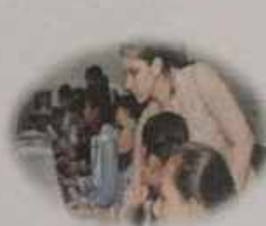
Principal Khalsa College of Education Ranjit Avenue, Amritsar