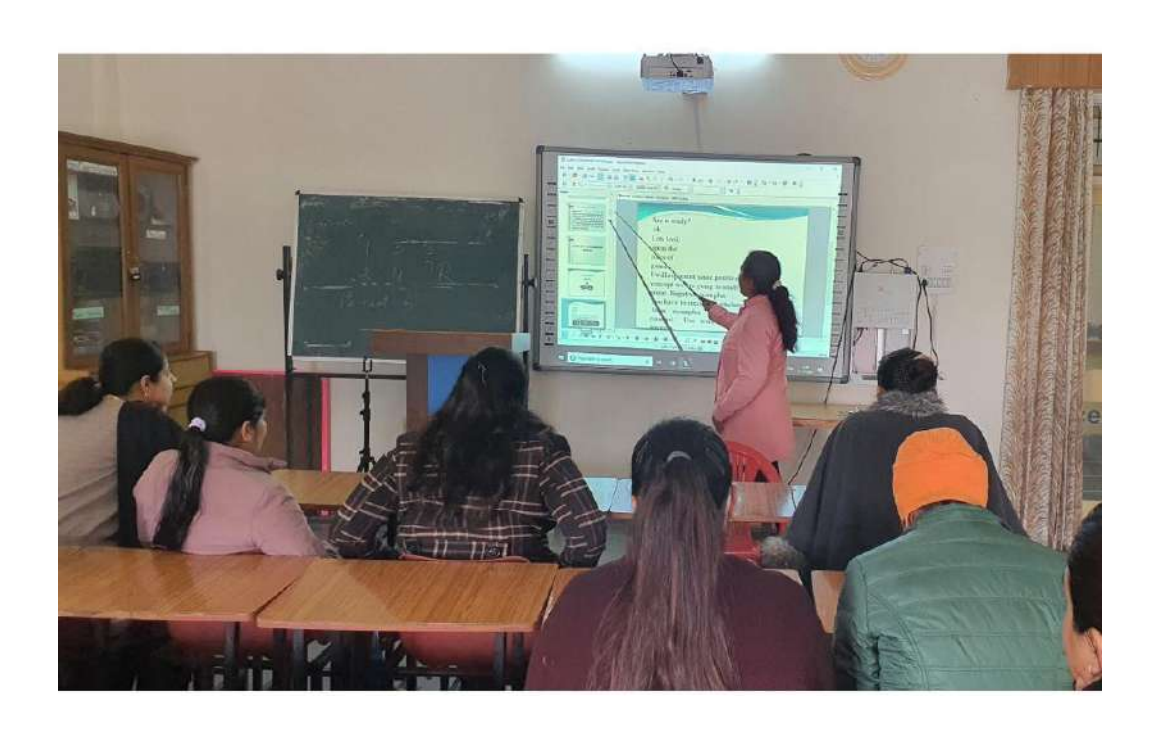
workshop on "Instructional strategies for science teachers" (23-24 September, 2019)