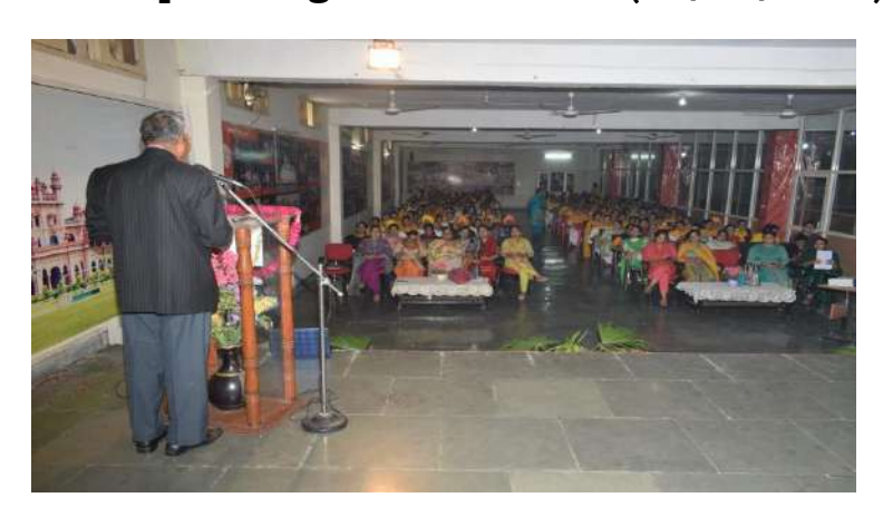
Extension Lectures on "Parameters of Teaching Effectiveness" (02-04-19)