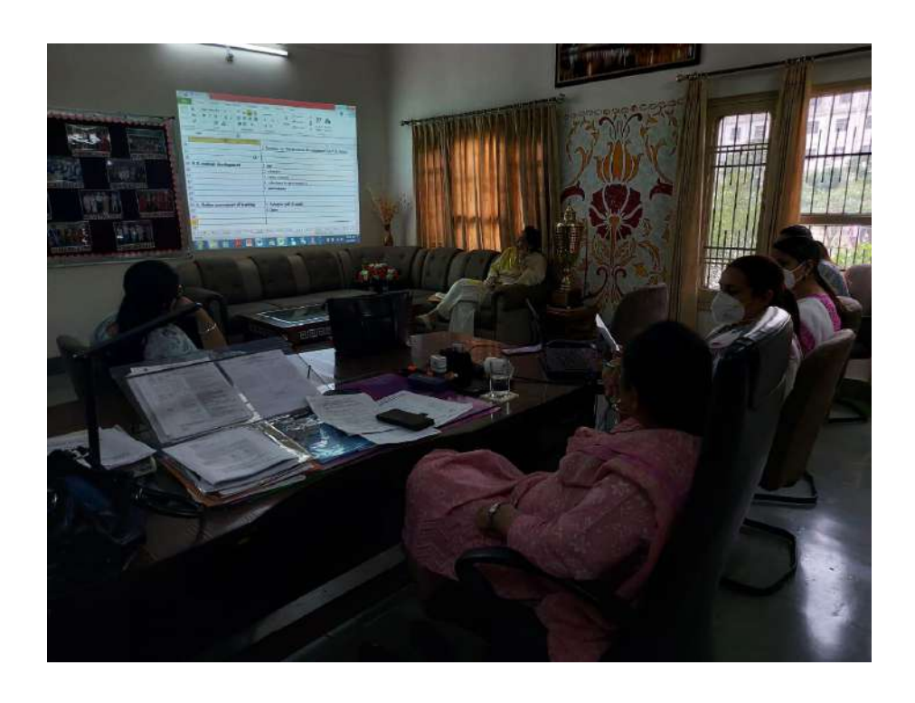
Orientation program on New Education Policy 2020(7th August, 2020)