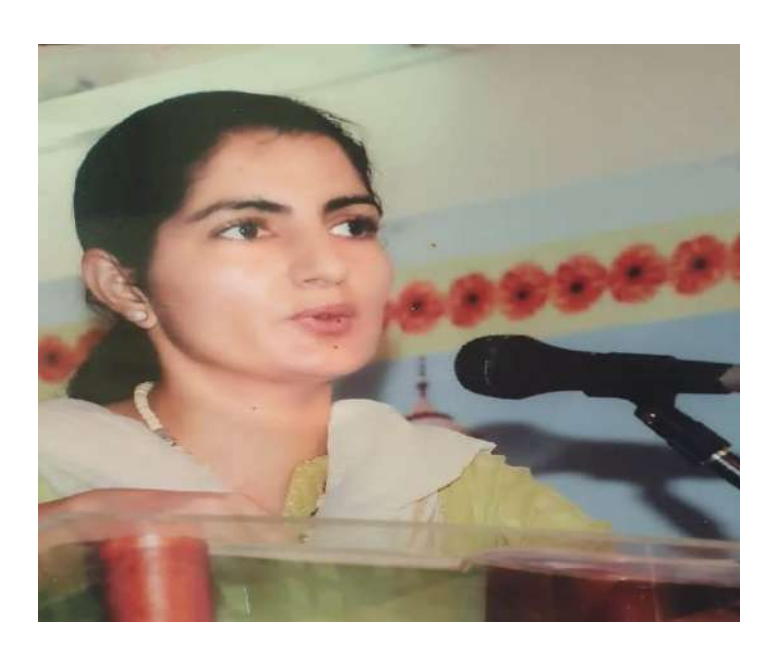
Extension Lecture on Integration of Technology in Education (17<sup>th</sup> December, 2016)