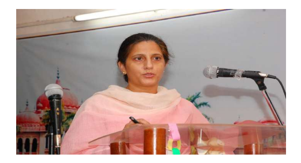
Workshop on the topic E- Content Development(8-5-2019)