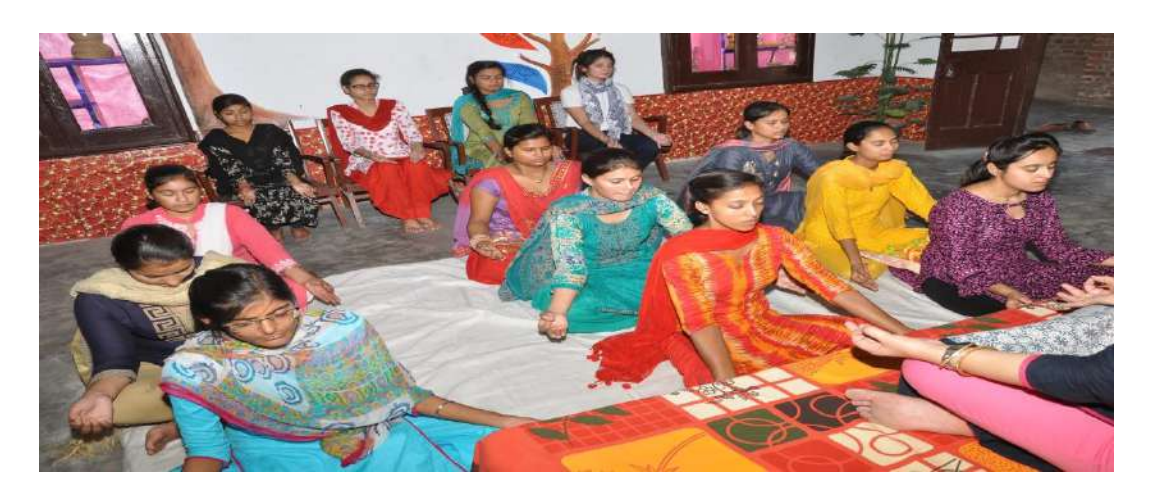
Workshop on 'Yoga & Meditation' (08/09/2018)