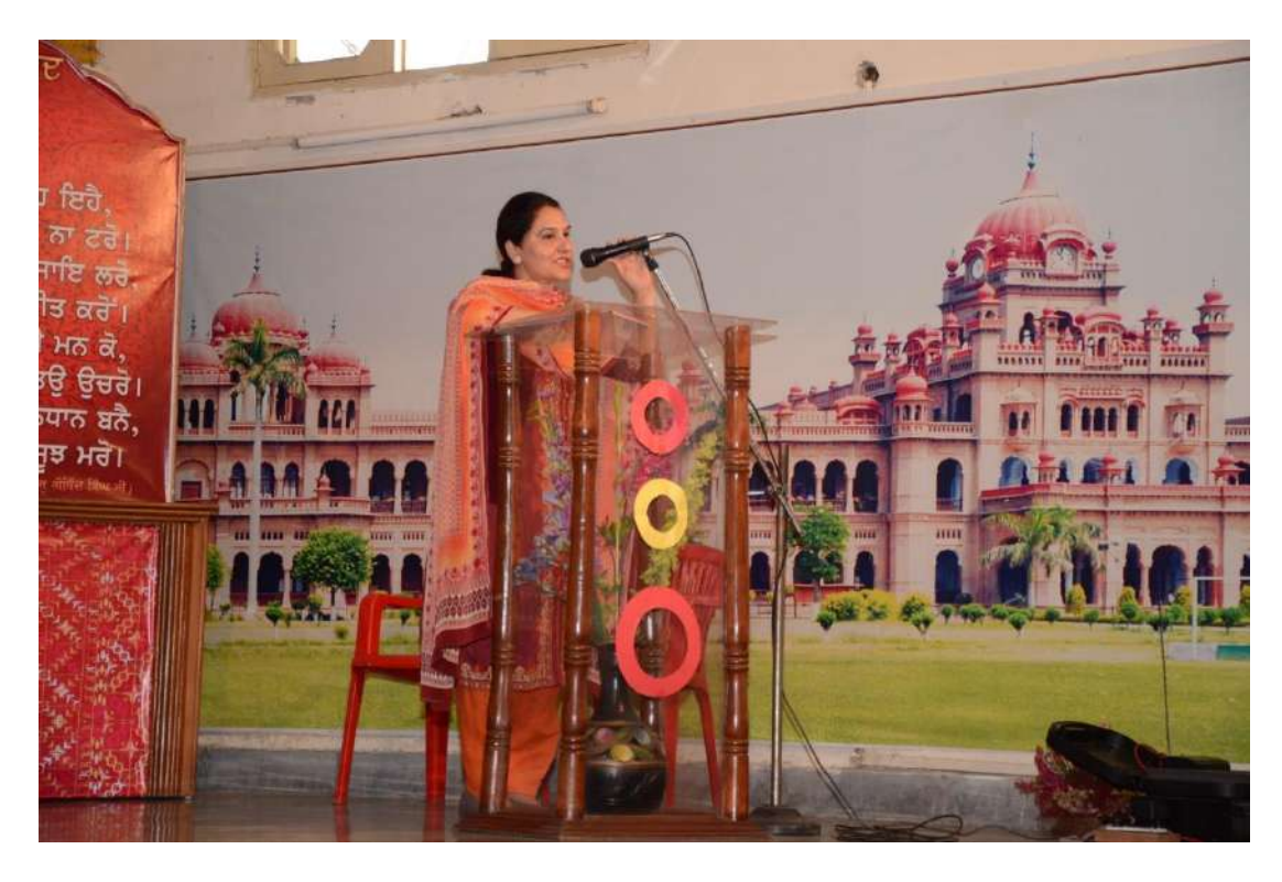
Lecture on "How to Write a Research Proposal" (July 30, 2017)