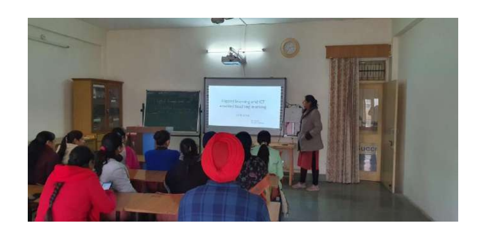
Workshop on Flipped Learning and ICT enabled Teaching Learning (23/10/2019)