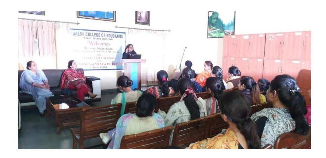
Interactive Session on Field Engagement and Internship (25th Feb 2021)