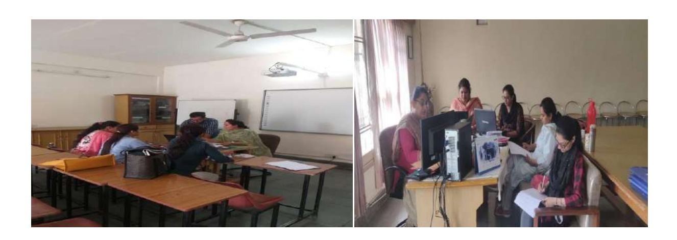
Workshop on Developing Internship Module For Teacher Education programmes (18,19 March,2021)