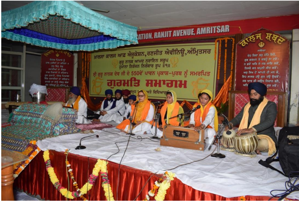
Gurmat Samagam on 550 th Birth anniversary of Guru Nanak Dev Ji