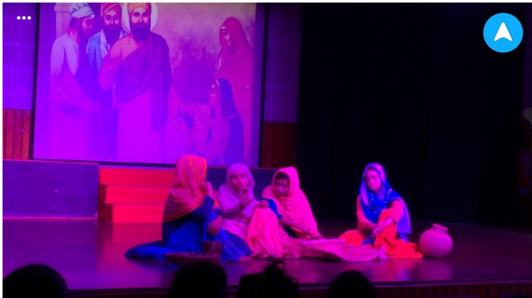
Play on 550 th Birth Anniversary of Guru Nanak Dev Ji