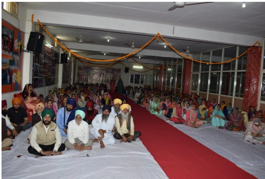
550 th Birth Anniversary of Guru Nanak Dev Ji