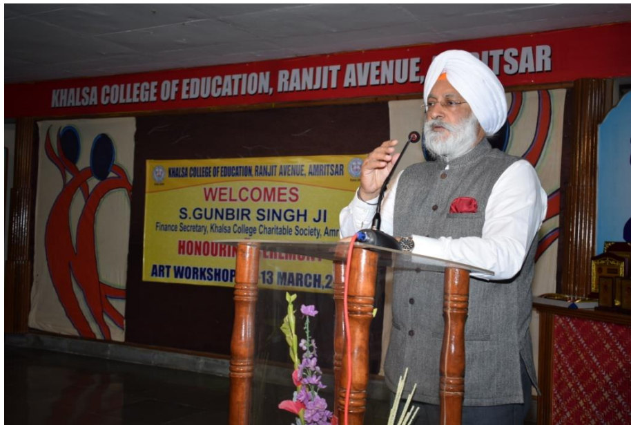
Art Workshop on 550 th Birth Anniversary of Guru Nanak Dev Ji