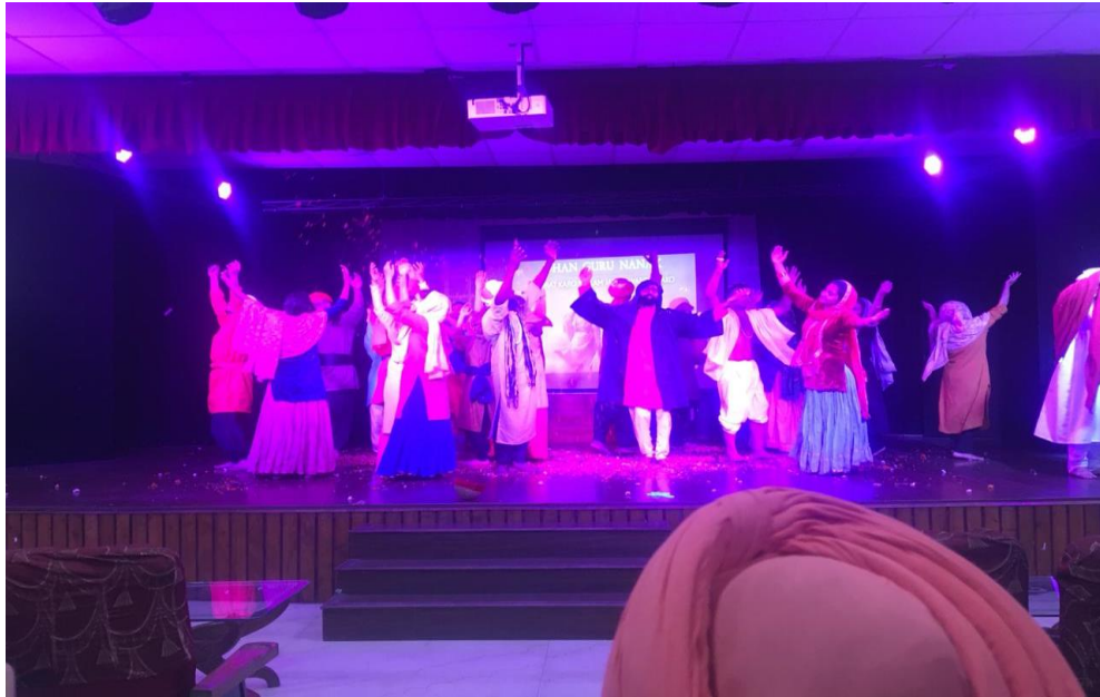
Play on 550 th Birth Anniversary of Guru Nanak Dev Ji