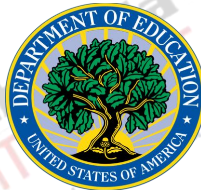
Logo of Department of Education, USA

The United States Department of Education is a Cabinet-level department of the United States government.